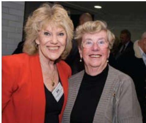
Life Activities Club Heidelberg – Allstars.

Life Activities Club Heidelberg – The Heidelberg Allstars is part of the Life Activities Club and provides an avenue for seniors aged 60 to 70 to dance, sing and perform for their peers at retirement villages. Their Community Bank® branch grant will fund costumes for their annual community concert.