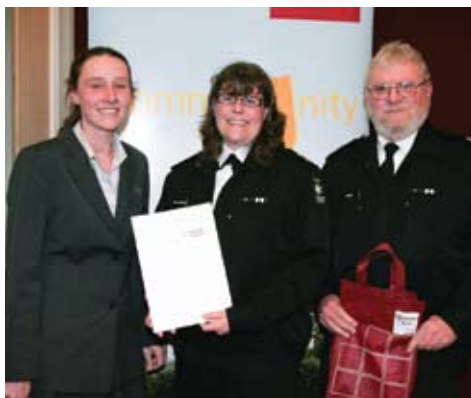
St John Ambulance.

St John Ambulance – Banyule Division: Based in Heidelberg, this group provide volunteer first aid services for community events. Their grant will purchase equipment including a defibrillator and training equipment.