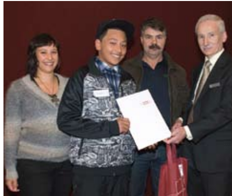
Open House Backyard Sports Program.

Open House – The Backyard Sports program is for local multicultural youth in West Heidelberg, offering sports programs that keep them connected in community, develop skills, networks and self-esteem.