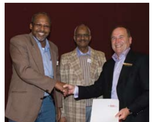
Somali Australian Council receiving their grant.

Somali Australian Council of Victoria – This group supports the Somali community with integration and engagement with their new life in Australia. The group will use their grant to fund equipment materials to support their education needs of these children, to encourage them to pursue their education.