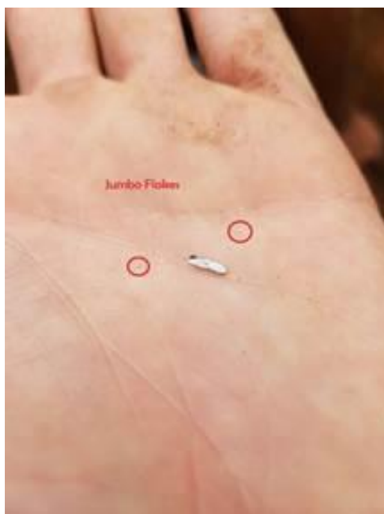
Figure 3 – Graphite flakes from Trench 1

Various bands of graphite were exposed throughout the trench and early indications are that the good results from the geophysical survey should be confirmed.