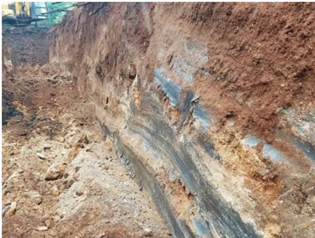
Figure 2 – Trench 1 in progress

Various bands of graphite were exposed throughout the trench and early indications are that the good results from the geophysical survey should be confirmed.