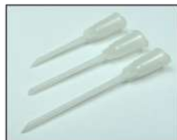
Figure7: Variation of needle length (19mm, 25mm and 32mm)