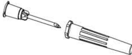
Figure 5: SoloFlow™ Medical Transfer Cannula

The SoloFlow™ Medical Transfer Cannula that has been developed using our patented manufacturing technology ( CoreIT® ) to provide a commercially attractive alternative to steel draw-up needles and reconstitution needles.