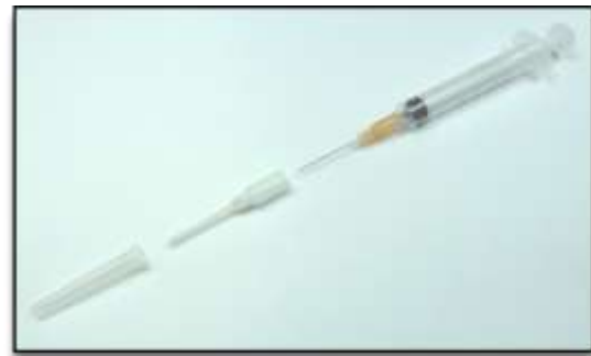
Figure 9: DuoDraw ® in expanded view