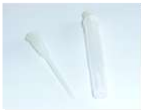
SoloFlow ™ Cannula

The Company has focused its research and development on their CoreIT ® manufacturing technology and key products such as: