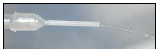
Figure 4: One piece polypropylene dispensing needle