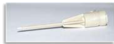
SSB's Plastic Hypodermic Needle

Telezon's polymer needles and manufacturing technology offer significant cost, environmental and social advantages over traditional steel needles.