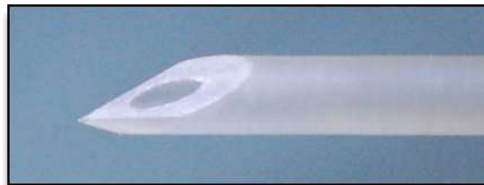
Figure 6: Lancet Needle point