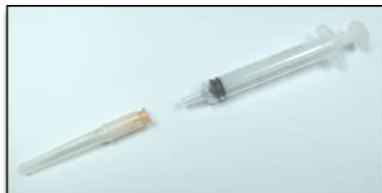
Figure 10: DuoDraw ® and standard Luer syringe