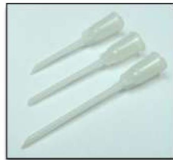
Figure 2: One piece plastic draw-up needles (moulded with CoreIT ®)