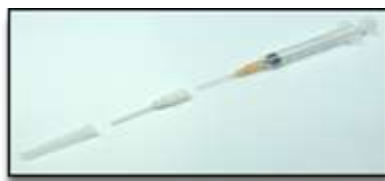
DuoDraw ® Cannula