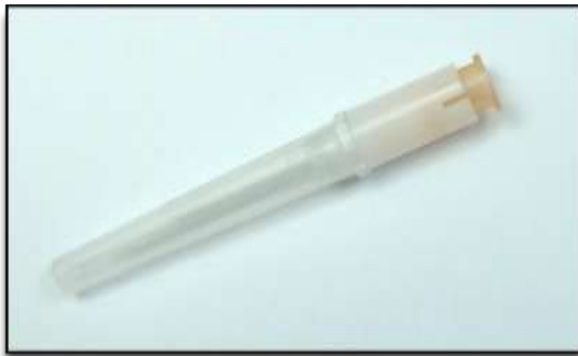
Figure 8: DuoDraw ® Transfer and Injection Unit

The patented DuoDraw ® Transfer and Injection Unit consist of a protective cap, a draw-up needle which functions as a needle sheath and an injection needle.