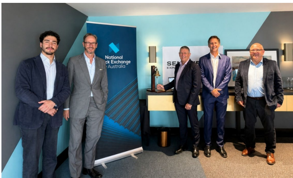
Figure 1: NSX bell ringing ceremony

The IPO raised $1.5 million through the issue of 7.5 million new shares at an issue price of $0.20 per share . The offer was oversubscribed, with the Company accepting $500,000 in subscriptions above the target raise of $1.0 million.