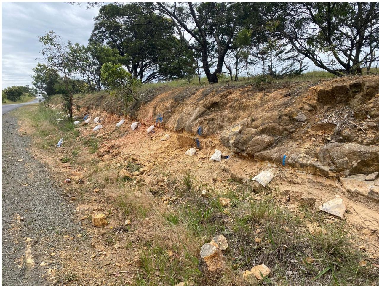
Figure 1: Roadside channel sampling of outcrop with quartz veining.