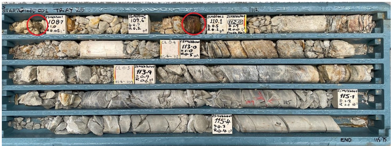
Figure 3: Example of partially filled void intersected in drilling. Red circles show wood from historical support timbers - interpreted drive of 1.4m apparent width (standard historical 3' wide drive).