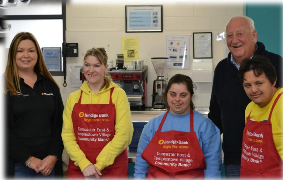
CEF support for Onemda – Café Ability

"Banking is our business....Community is our focus"