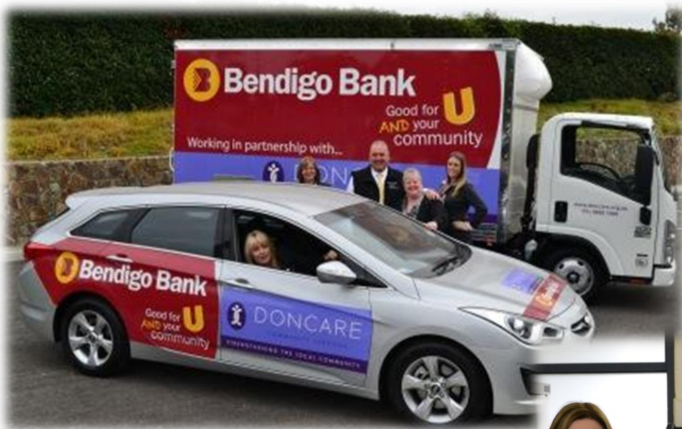
CEF support for Doncare Community Services