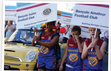
Banyule Junior Football Club junior players.

This really proves that when you choose to bank locally, you choose to help your community.