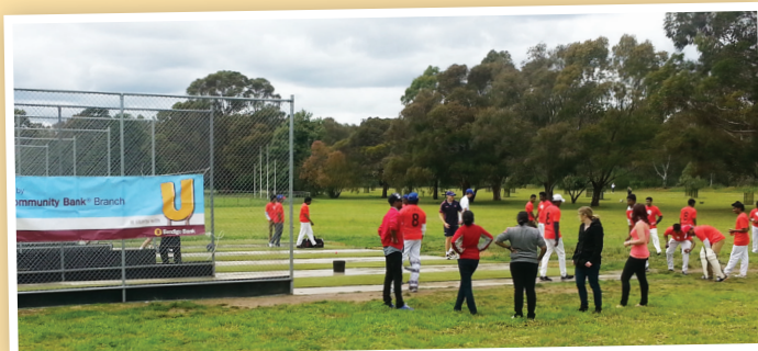
Banyule Refugee Match 2013 .