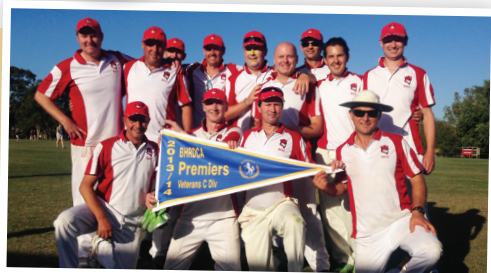
North Alphonington Cricket Club Premiers 2014.